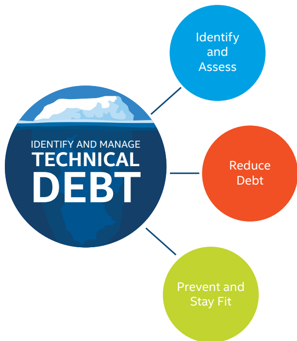
Figure 2. Consisting of three steps—identify and assess, pay and reduce, and prevent and stay fit—our unique technical debt framework spans the business, data, application, and technology domains.

Sporadically pursuing technical debt is not very effective. Instead, we use a framework to guide our technical debt efforts. This framework is holistic, in that it encompasses the full scope of technical debt to drive prioritization, aid in decision making, and fuel digital transformation. Our unique framework spans the entire business, data, application, and technology (BDAT) domains. Figure 2 provides a high-level summary of the three phases of our technical debt framework. See “ Applying the Technical Debt Framework ” for more details.