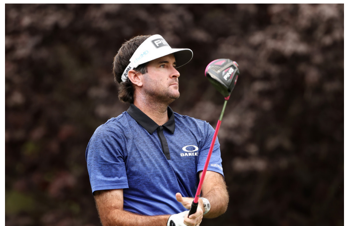
Bubba Watson, two-time Masters champion, plays the new PING G425 driver.

Morales observes that the system is fostering creativity and throughput. "We're experimenting more now that we have access to this larger system," Morales says. "With the performance and the simulation tools on the appliance, we can run different types of simulations and multiple types of analysis at the same time. We don't have to wait until another job has completed, so we're getting much more throughput. We're seeing faster feedback loops for the